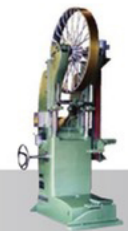
•YL-42LB •YL-44LB •YL-48LB