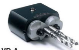
VD-A ADJUSTABLE CENTER BORING HEAD:18mm~90mm .