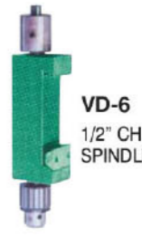
VD-6 1/2" CHUCK SPINDLE