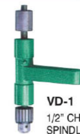
VD-1 1/2" CHUCK SPINDLE