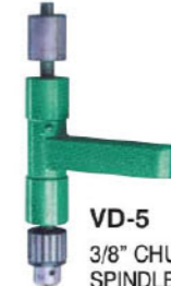
VD-5 3/8" CHUCK SPINDLE