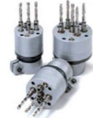
VD-B FIXED CENTER BORING HEAD