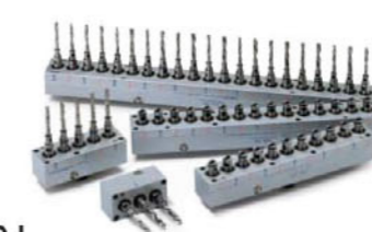
VD-L FIXED CENTER BORING HEAD